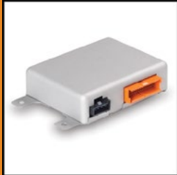
GM® Transfer Case Control Module