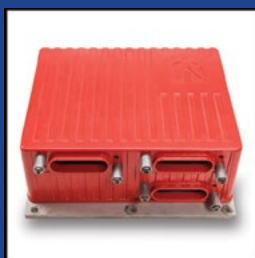
Cummins® Celect Engine Control Module