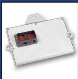
Cummins® ISB Engine Control Module

Advanced Control Electronics are a category of vehicle electronics that are typically programmed to be vehicle and application specific based on vehicle configuration and options. Smart actuators, which require special calibration tools, also fall into this category. Flight Diesel is now offering remanufactured advanced control electronics for light, medium, and heavy duty applications.