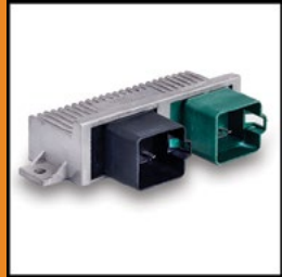
Ford® Glow Plug Control Module