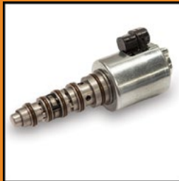
Garrett® Electro-hydraulic Actuator (R&R)

For additional product details visit www.flightdiesel.net Click on Resources / Product Data Sheets