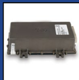
Allison® Transmission Electronic Control