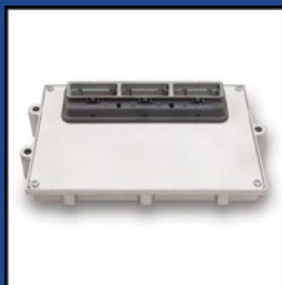
Dodge® Pickup Power- train Control Module