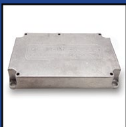
Detroit® DDEC Engine Control Module