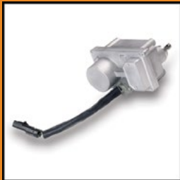
Delphi® Borg Warner® S300V Actuator (R&R)