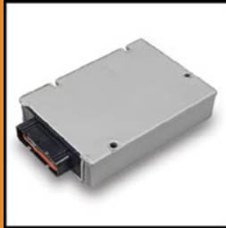
Ford® Injector Driver Module