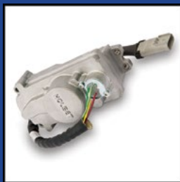
Delphi® - Holset® Smart Actuator (R&R)

For additional product details visit www.flightdiesel.net Click on Resources / Product Data Sheets