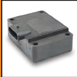
GM® Pump Mounted Driver