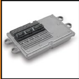
Ford® Fuel Injection Control Module

Flight Diesel offers remanufactured Plug 'N Play vehicle electronics that require no additional programming to the specific application. These quality service parts will restore your diesel vehicle to proper stock functionality.